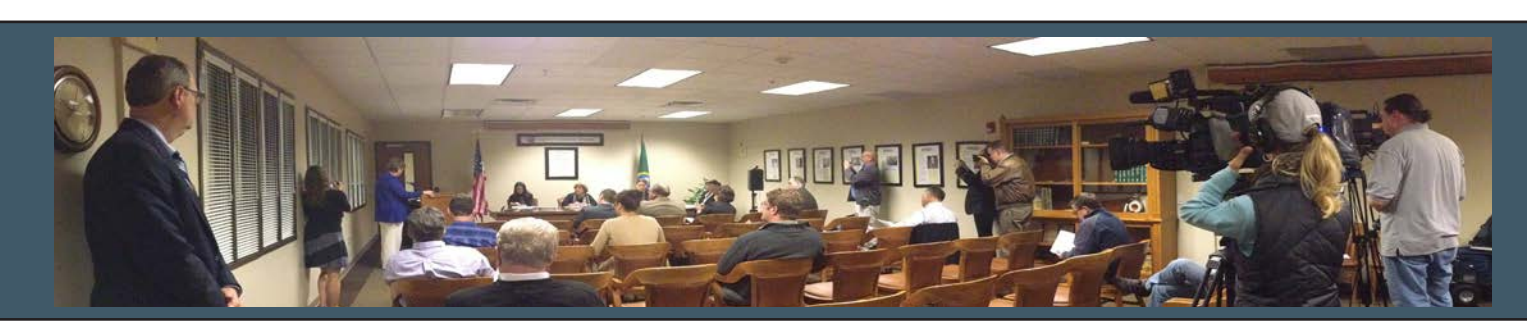
Washington State Liquor Control Board

Respect and courtesy Professionalism and integrity Open communication Internal and external accountability Measurable and meaningful results Public trust and stakeholder involvement Continuous improvement