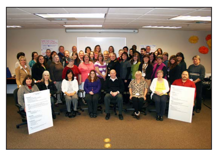
WSLCB Licensing and Regulation Division.