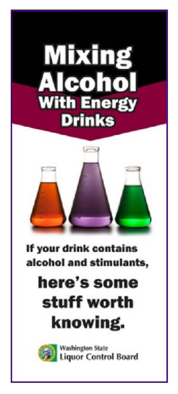
WSLCB produced brochure about the dangers of mixing energy drinks and alcohol.

Other collaborative efforts include participation in the implementation of the 2012 Healthy Youth Survey, the Strategic Prevention Enhancement Consortium, the Washington Impaired Driving Advisory Council, and the WA Prevention Research Sub-committee. Results included the development of a five-year strategic plan for Substance Abuse Prevention and Mental Health Promotion in Washington State, a successful WA State Prevention Summit and participation by 36 groups across 20 counties in Let's Draw the Line Between Youth and Alcohol activities.