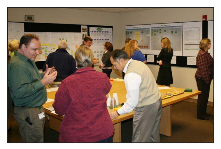
Agency personnel take part in an open house to learn more about Lean principles.

Lean process improvement is an integral part of state government's Efficiency and Effectiveness Goal under Results Washington and remains a key element of our agency's culture.