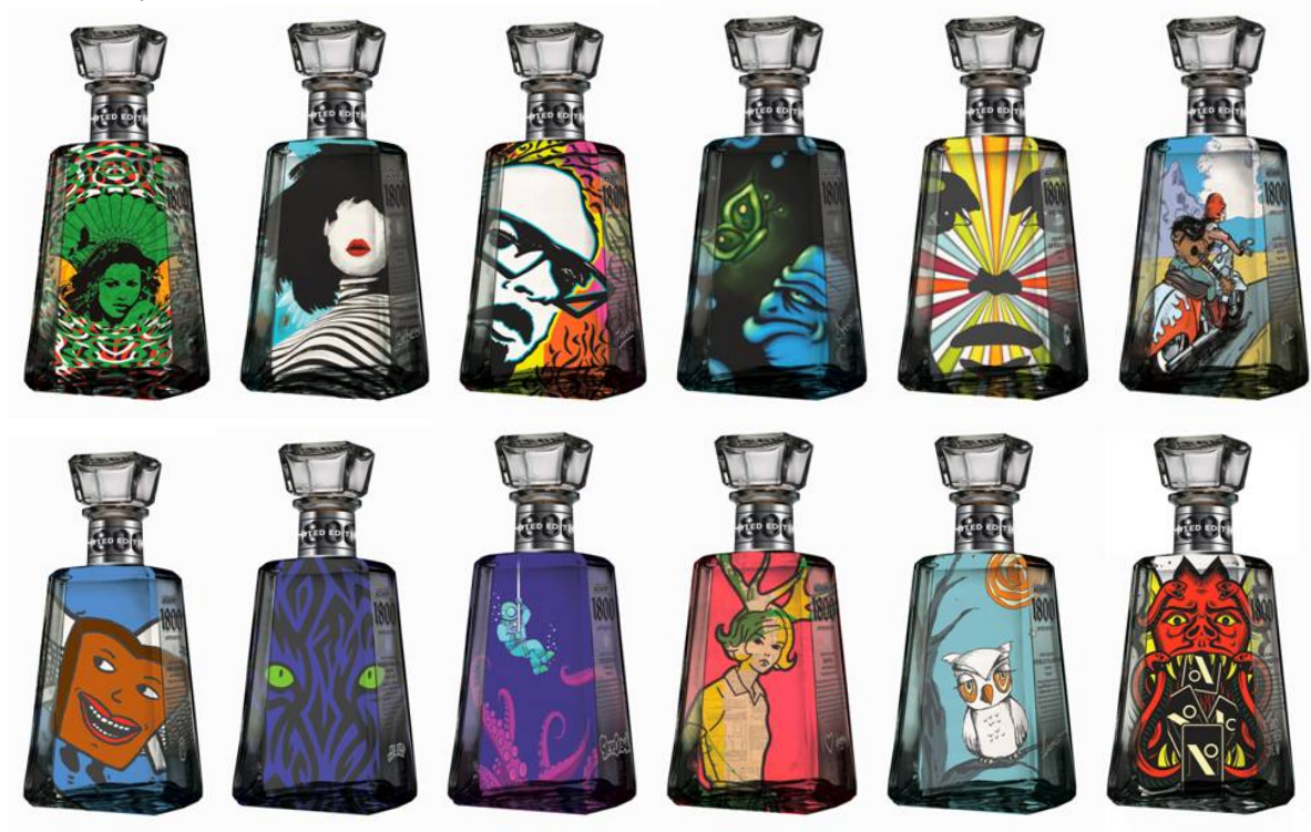
4 ) The following new item is in the Distribution Center. All stores received one case of this item. Managers are reminded to immediately display this item upon receipt in their outlets. Stores and contract liquor stores not receiving an allocation may place an order in the normal manner. Split case available.

Introducing 12 new bottles designed by up-and-coming artists from New York to Hawaii, the 1800 Tequila Essential Artists series celebrates a dynamic range of original artwork on a unique and unexpected medium – bottles of 100% Agave Silver Tequila! Showcasing eleven designs gathered from over 15,000 online submissions, selected by 1800 Tequila, and one special edition 'celebrity artist' bottle, this new line is a vibrant example of the undiscovered, yet soon-to-be-recognized talent residing across the country.